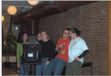
The Piano Lounge AC

Gregory continues to grow and develop as a close-knit community. We had our biggest retention ever this year—come Sep-