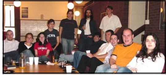
Graduates ('06), Staff, and one sneaky freshman at the Senior Breakfast Buffet.

The building was apparently condemned; we thought some of you might take pleasure in the view from our window. (This also gives us an excuse to print photos Vicky Sakr doesn't appear in).